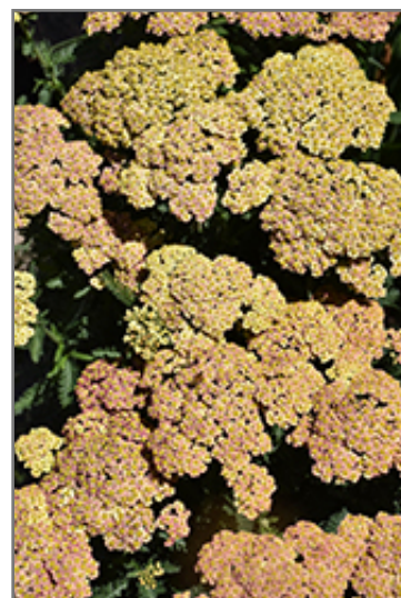
Firefly Peach Sky Yarrow flowers

Firefly Peach Sky Yarrow is recommended for the following landscape applications;