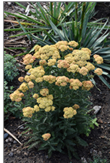
Firefly Peach Sky Yarrow in bloom