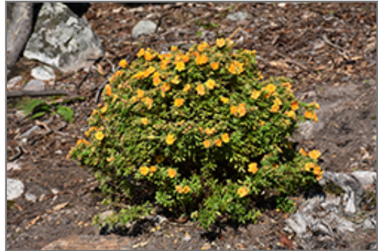
Marmalade Potentilla in bloom

This shrub does best in full sun to partial shade. It is very adaptable to both dry and moist locations, and should do just fine under typical garden conditions. It is considered to be drought-tolerant, and thus makes an ideal choice for a low-water garden or xeriscape application. It is not particular as to soil type or pH. It is highly tolerant of urban pollution and will even thrive in inner city environments. This is a selection of a native North American species.