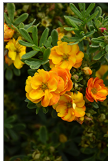
Marmalade Potentilla flowers