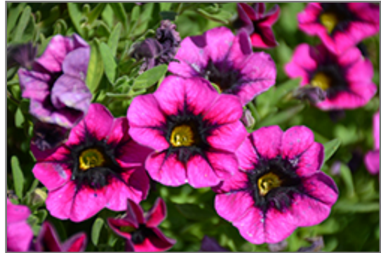
Superbells Blackcurrent Punch Calibrachoa flowers

Superbells Blackcurrent Punch Calibrachoa is a fine choice for the garden, but it is also a good selection for planting in outdoor containers and hanging baskets. Because of its trailing habit of growth, it is ideally suited for use as a 'spiller' in the 'spiller-thriller-filler' container combination; plant it near the edges where it can spill gracefully over the pot. Note that when growing plants in outdoor containers and baskets, they may require more frequent waterings than they would in the yard or garden.