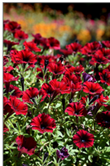
Supertunia Black Cherry Petunia flowers