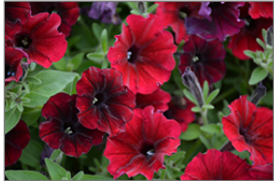
Supertunia Black Cherry Petunia flowers

Supertunia Black Cherry Petunia will grow to be about 10 inches tall at maturity, with a spread of 24 inches. When grown in masses or used as a bedding plant, individual plants should be spaced approximately 16 inches apart. Its foliage tends to remain low and dense right to the ground. This fast-growing annual will normally live for one full growing season, needing replacement the following year.