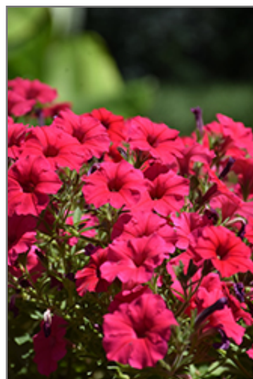
Supertunia Vista Paradise Petunia flowers

Supertunia Vista Paradise Petunia is recommended for the following landscape applications;