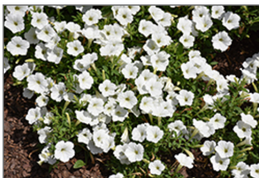
Supertunia Vista Snowdrift Petunia flowers