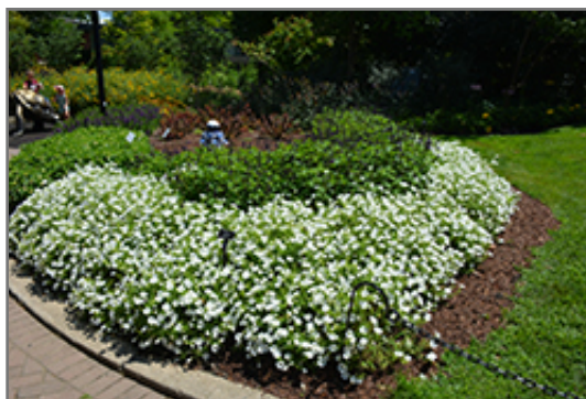
Supertunia Vista Snowdrift Petunia in bloom