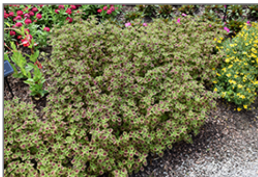
ColorBlaze Chocolate Drop Coleus