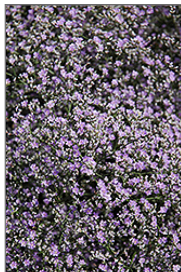
Sea Lavender flowers