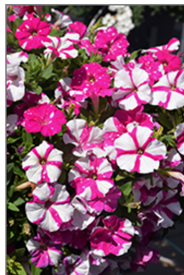
Headliner Pink Sky Petunia flowers