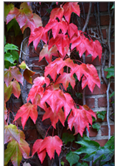
Boston Ivy in fall