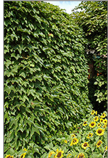
Boston Ivy

This woody vine does best in full sun to partial shade. It is very adaptable to both dry and moist locations, and should do just fine under average home landscape conditions. It is considered to be drought-tolerant, and thus makes an ideal choice for xeriscaping or the moisture-conserving landscape. It is not particular as to soil type or pH, and is able to handle environmental salt. It is highly tolerant of urban pollution and will even thrive in inner city environments. This species is not originally from North America.