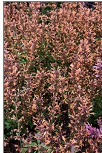
Sunrise Orange Hyssop flowers