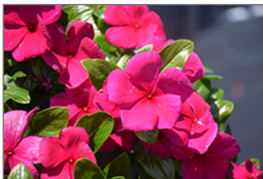
Cora XDR Hotgenta flowers

Cora XDR Hotgenta is recommended for the following landscape applications;