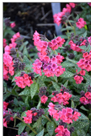
Shrimps On The Barbie Lungwort flowers

Shrimps On The Barbie Lungwort is recommended for the following landscape applications;