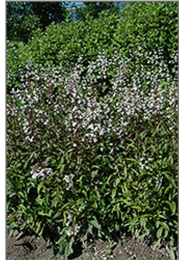
Husker Red Beard Tongue in bloom

Husker Red Beard Tongue is a fine choice for the garden, but it is also a good selection for planting in outdoor pots and containers. With its upright habit of growth, it is best suited for use as a 'thriller' in the 'spiller-thriller-filler' container combination; plant it near the center of the pot, surrounded by smaller plants and those that spill over the edges. Note that when growing plants in outdoor containers and baskets, they may require more frequent waterings than they would in the yard or garden. Be aware that in our climate, most plants cannot be expected to survive the winter if left in containers outdoors, and this plant is no exception. Contact our experts for more information on how to protect it over the winter months.