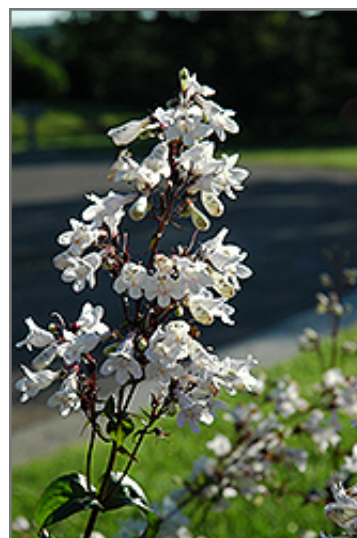
Husker Red Beard Tongue flowers