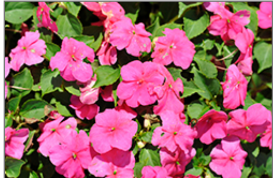
Beacon Rose Impatiens flowers