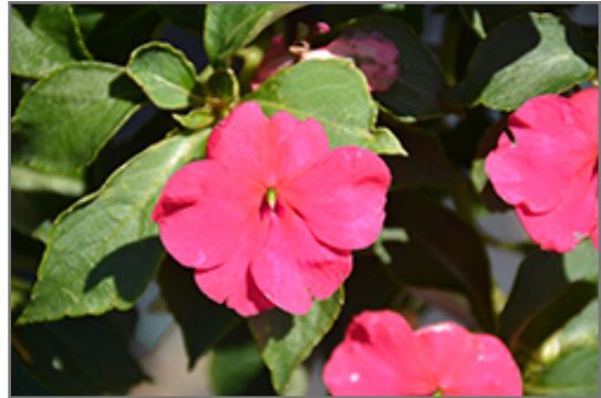
Beacon Rose Impatiens flowers

Beacon Rose Impatiens is a fine choice for the garden, but it is also a good selection for planting in outdoor containers and hanging baskets. It is often used as a 'filler' in the 'spiller-thriller-filler' container combination, providing a mass of flowers against which the thriller plants stand out. Note that when growing plants in outdoor containers and baskets, they may require more frequent waterings than they would in the yard or garden.