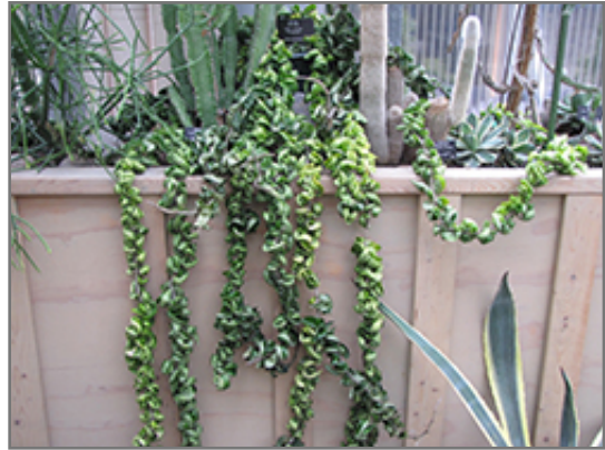
Hindu Rope Plant

When grown indoors, Hindu Rope Plant can be expected to grow to be about 12 inches tall at maturity, with a spread of 3 feet. It grows at a medium rate, and under ideal conditions can be expected to live for approximately 10 years. This houseplant should be situated in a location that gets indirect sunlight at most, although it will usually require a more brightly-lit environment than what artificial indoor lighting alone can provide. It is very adaptable to both dry and moist soil, but will not tolerate any standing water. The surface of the soil shouldn't be allowed to dry out completely, and so you should expect to water this plant once and possibly even twice each week. Be aware that your particular watering schedule may vary depending on its location in the room, the pot size, plant size and other conditions; if in doubt, ask one of our experts in the store for advice. It is particular about its soil conditions, with a strong preference for rich, acidic soil. Contact the store for specific recommendations on pre-mixed potting soil for this plant.