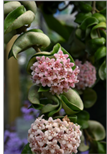
Hindu Rope Plant flowers

This is an herbaceous houseplant with a spreading, ground-hugging habit of growth. This plant usually looks its best without pruning, although it will tolerate pruning.