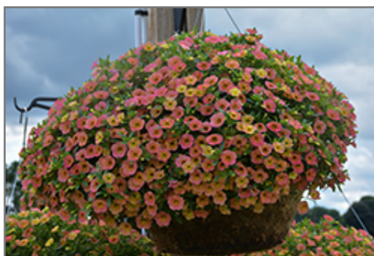
Cha-Cha Diva Apricot Calibrachoa in bloom