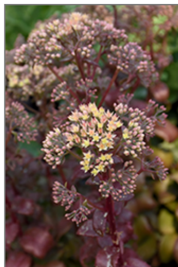
Peach Pearls Stonecrop flowers