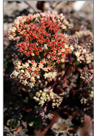
Peach Pearls Stonecrop flowers

Peach Pearls Stonecrop is a fine choice for the garden, but it is also a good selection for planting in outdoor pots and containers. With its upright habit of growth, it is best suited for use as a 'thriller' in the 'spiller-thriller-filler' container combination; plant it near the center of the pot, surrounded by smaller plants and those that spill over the edges. Note that when growing plants in outdoor containers and baskets, they may require more frequent waterings than they would in the yard or garden. Be aware that in our climate, most plants cannot be expected to survive the winter if left in containers outdoors, and this plant is no exception. Contact our experts for more information on how to protect it over the winter months.