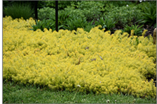
Angelina Stonecrop

This plant does best in full sun to partial shade. It prefers dry to average moisture levels with very well-drained soil, and will often die in standing water. It is considered to be drought-tolerant, and thus makes an ideal choice for a low-water garden or xeriscape application. It is not particular as to soil pH, but grows best in poor soils, and is able to handle environmental salt. It is highly tolerant of urban pollution and will even thrive in inner city environments. This is a selected variety of a species not originally from North America. It can be propagated by division; however, as a cultivated variety, be aware that it may be subject to certain restrictions or prohibitions on propagation.