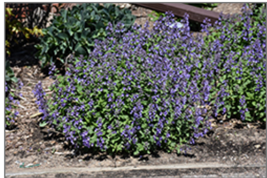
Picture Purrfect Catmint in bloom