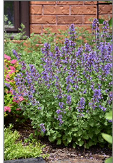
Picture Purrfect Catmint flowers