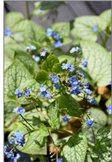
Jack of Diamonds Bugloss flowers