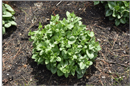
Jack of Diamonds Bugloss

Jack of Diamonds Bugloss is a fine choice for the garden, but it is also a good selection for planting in outdoor pots and containers. It is often used as a 'filler' in the 'spiller-thriller-filler' container combination, providing a mass of flowers and foliage against which the thriller plants stand out. Note that when growing plants in outdoor containers and baskets, they may require more frequent waterings than they would in the yard or garden. Be aware that in our climate, most plants cannot be expected to survive the winter if left in containers outdoors, and this plant is no exception. Contact our experts for more information on how to protect it over the winter months.