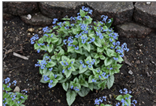
Sterling Silver Bugloss in bloom