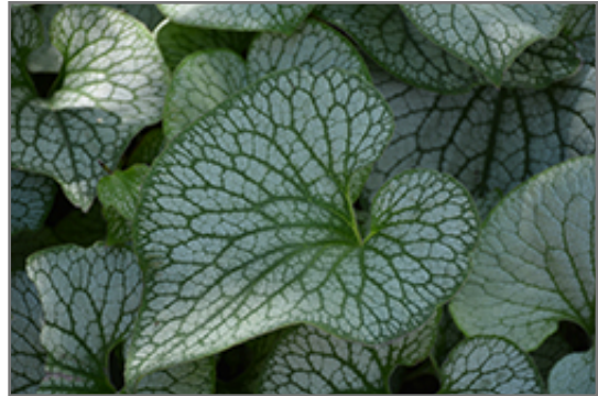
Sterling Silver Bugloss foliage

Sterling Silver Bugloss is a fine choice for the garden, but it is also a good selection for planting in outdoor pots and containers. It is often used as a 'filler' in the 'spiller-thriller-filler' container combination, providing a mass of flowers and foliage against which the thriller plants stand out. Note that when growing plants in outdoor containers and baskets, they may require more frequent waterings than they would in the yard or garden. Be aware that in our climate, most plants cannot be expected to survive the winter if left in containers outdoors, and this plant is no exception. Contact our experts for more information on how to protect it over the winter months.