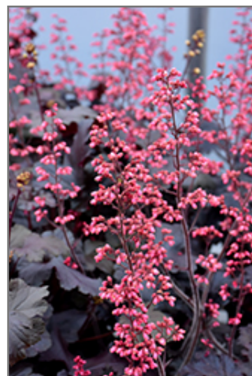
Timeless Night Coral Bells flowers

Timeless Night Coral Bells is recommended for the following landscape applications;