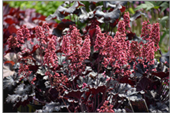
Timeless Night Coral Bells flowers

Timeless Night Coral Bells will grow to be about 10 inches tall at maturity extending to 18 inches tall with the flowers, with a spread of 18 inches. When grown in masses or used as a bedding plant, individual plants should be spaced approximately 16 inches apart. Its foliage tends to remain low and dense right to the ground. It grows at a medium rate, and under ideal conditions can be expected to live for approximately 10 years. As an evergreen perennial, this plant will typically keep its form and foliage year-round.