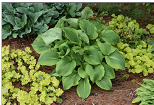
Twin Cities Hosta