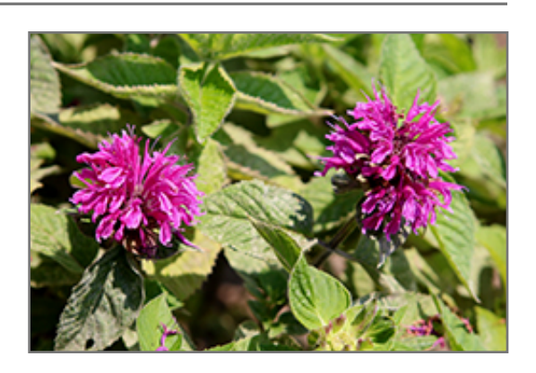
Bee-You Bee-Free Beebalm flowers