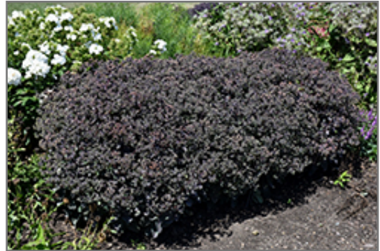
Night Light Stonecrop in bloom

Night Light Stonecrop is recommended for the following landscape applications;