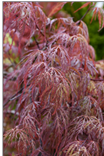
Velvet Viking Japanese Maple foliage