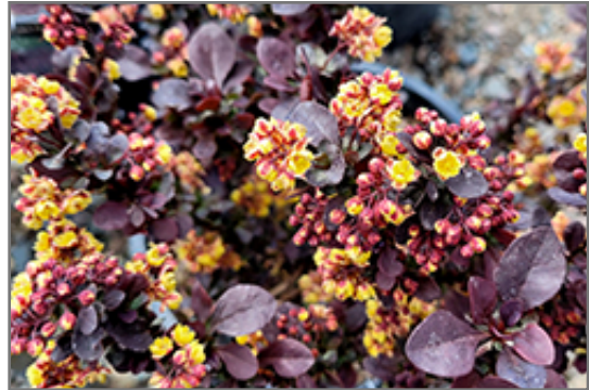
Concorde Japanese Barberry flowers

Concorde Japanese Barberry will grow to be about 18 inches tall at maturity, with a spread of 24 inches. It tends to fill out right to the ground and therefore doesn't necessarily require facer plants in front. It grows at a slow rate, and under ideal conditions can be expected to live for approximately 20 years.