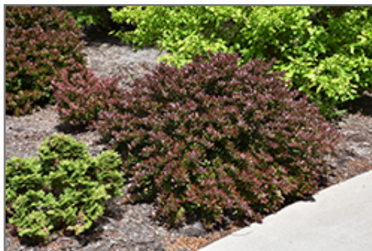
Concorde Japanese Barberry

Concorde Japanese Barberry is recommended for the following landscape applications;