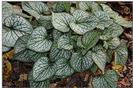
Jack Frost Bugloss foliage