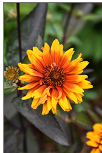
Summer Eclipse False Sunflower flowers