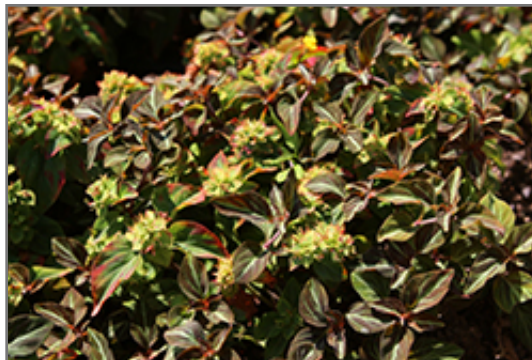
Night Light Moneywort foliage