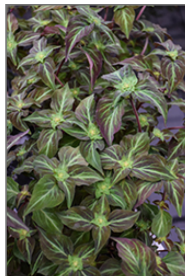
Night Light Moneywort foliage

Night Light Moneywort is recommended for the following landscape applications;