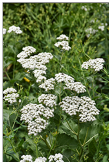
Wild Quinine flowers

Wild Quinine is recommended for the following landscape applications;