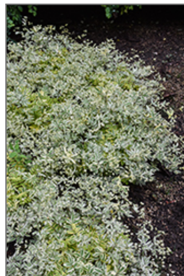
Golden Feathers Jacob's Ladder foliage