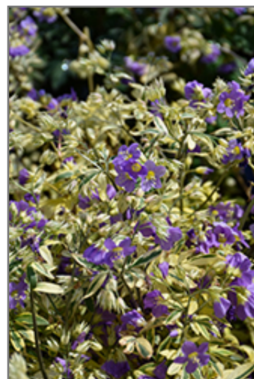
Golden Feathers Jacob's Ladder flowers