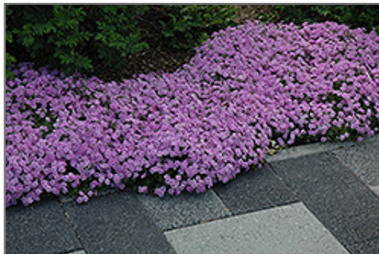
Fort Hill Moss Phlox in bloom