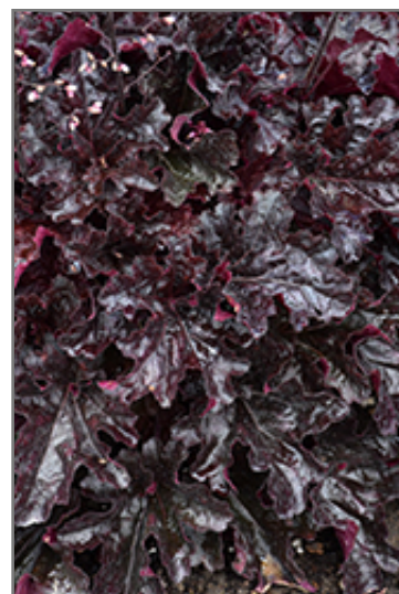
Dressed Up Evening Gown Coral Bells foliage