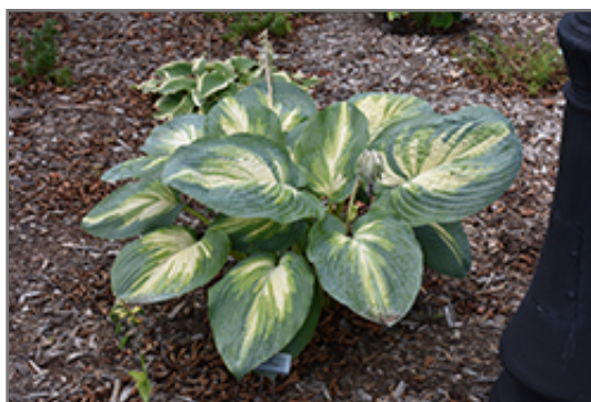
Sound Of Music Hosta