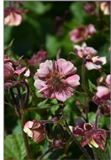
Tempo Rose Avens flowers