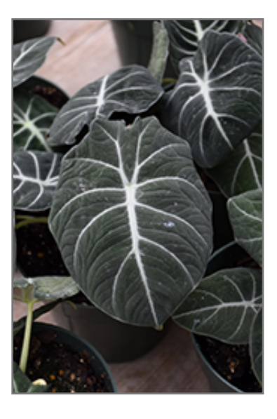
Mythic Black Velvet Jewel Alocasia foliage

This is an open herbaceous evergreen houseplant with an upright spreading habit of growth. This plant usually looks its best without pruning, although it will tolerate pruning.