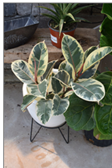
Variegated Rubber Tree in full

There are many factors that will affect the ultimate height, spread and overall performance of a plant when grown indoors; among them, the size of the pot it's growing in, the amount of light it receives, watering frequency, the pruning regimen and repotting schedule. Use the information described here as a guideline only; individual performance can and will vary. Please contact the store to speak with one of our experts if you are interested in further details concerning recommendations on pot size, watering, pruning, repotting, etc.