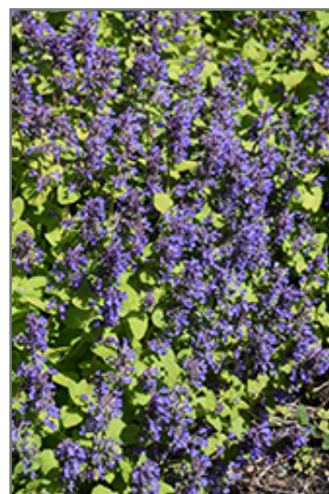
Chartreuse On The Loose Catmint flowers