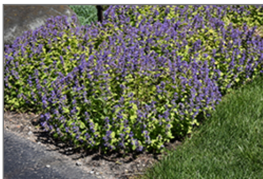
Chartreuse On The Loose Catmint in bloom

Chartreuse On The Loose Catmint is recommended for the following landscape applications;