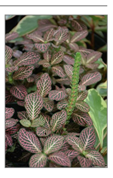
Red Anne Nerve Plant in full

There are many factors that will affect the ultimate height, spread and overall performance of a plant when grown indoors; among them, the size of the pot it's growing in, the amount of light it receives, watering frequency, the pruning regimen and repotting schedule. Use the information described here as a guideline only; individual performance can and will vary. Please contact the store to speak with one of our experts if you are interested in further details concerning recommendations on pot size, watering, pruning, repotting, etc.