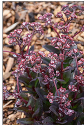
Conga Line Stonecrop flowers