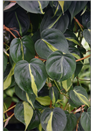
Lemon Stripe Philodendron foliage

When grown indoors, Lemon Stripe Philodendron can be expected to grow to be about 12 inches tall at maturity, with a spread of 6 feet. It grows at a fast rate, and under ideal conditions can be expected to live for approximately 10 years. This houseplant performs well in both bright or indirect sunlight and strong artificial light, and can therefore be situated in almost any well-lit room or location. It does best in average to evenly moist soil, but will not tolerate standing water. The surface of the soil shouldn't be allowed to dry out completely, and so you should expect to water this plant once and possibly even twice each week. Be aware that your particular watering schedule may vary depending on its location in the room, the pot size, plant size and other conditions; if in doubt, ask one of our experts in the store for advice. It will benefit from a regular feeding with a general-purpose fertilizer with every second or third watering. It is not particular as to soil type or pH; an average potting soil should work just fine. Be warned that parts of this plant are known to be toxic to humans and animals, so special care should be exercised if growing it around children and pets.