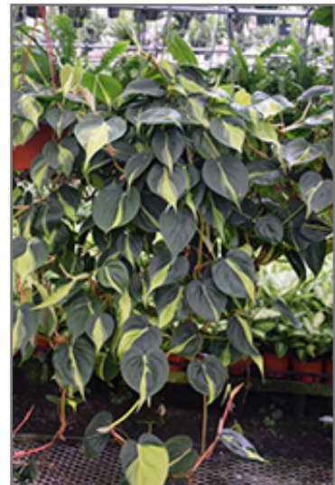
Lemon Stripe Philodendron in full