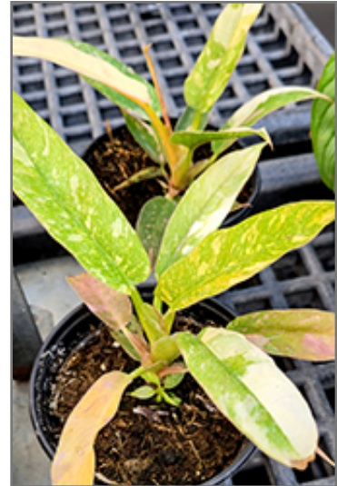
Ring of Fire Philodendron foliage

There are many factors that will affect the ultimate height, spread and overall performance of a plant when grown indoors; among them, the size of the pot it's growing in, the amount of light it receives, watering frequency, the pruning regimen and repotting schedule. Use the information described here as a guideline only; individual performance can and will vary. Please contact the store to speak with one of our experts if you are interested in further details concerning recommendations on pot size, watering, pruning, repotting, etc.