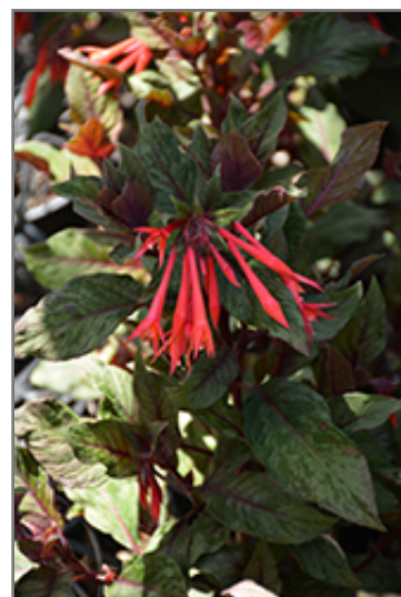
Firecracker Fuchsia flowers