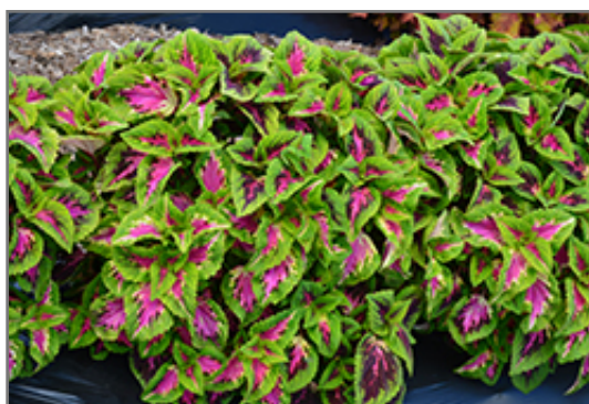
French Quarter Coleus