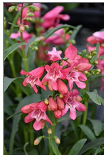
Bejeweled Pink Pearls Beard Tongue flowers