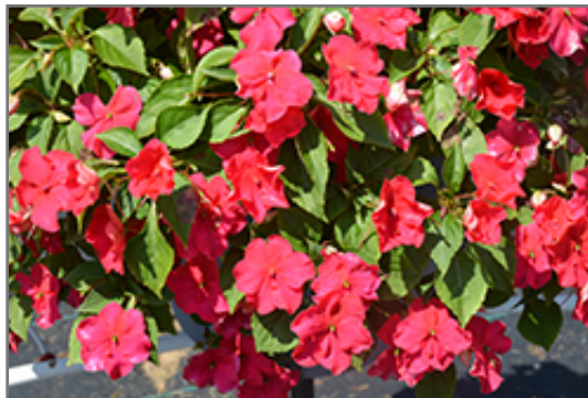
Beacon Lipstick Impatiens flowers