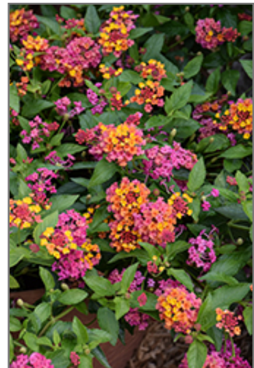
PassionFruit Lantana flowers