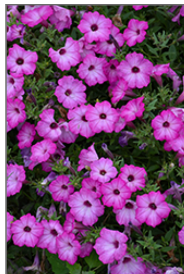
Supertunia Tiara Pink Petunia flowers

Supertunia Tiara Pink Petunia is recommended for the following landscape applications;